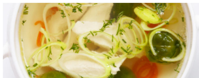
Make a spicy leek and pepper soup if you have any congestion.