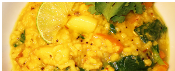
Simple kitchari with vegetables, garnished with lime and cilantro.