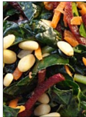
Marinated chard, shredded carrot, soaked almonds and shredded beets. Simple food.